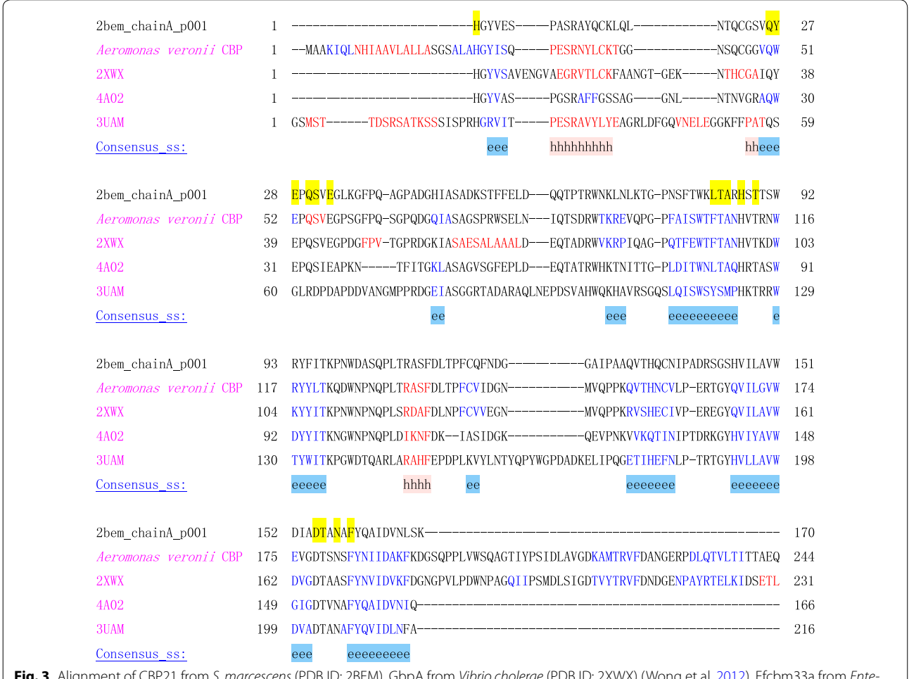
Fig. 3 Alignment of CBP21 from S. marcescens (PDB ID: 2BEM), GbpA from Vibrio cholerae (PDB ID: 2XWX) (Wong et al. 2012), Efcbm33a from Ente-rococcus faecalis (PDB ID: 4A02) (Vaaje-Kolstad et al. 2012), Chitin Binding Domain from Burkholderia pseudomallei (PDB ID: 3UAM) and CBP from A. veronii B565 using PROMALS3D (http://prodata.swmed.edu/promals3d/promals3d.php). Predicted secondary structures: red h: alpha-helix; blue e: beta-strand. Residues involved in chitin binding based on a 2H/1H exchange experiment (Q53, Q57, S58, L110, T111, A112, H114 and T116 of CBP21) (Aachmann et al. 2012) or determined by site-directed mutagenesis (Y54, E55, E60, H114, D182 and N185 of CBP21) (Vaaje-Kolstad et al. b) or highly conserved residues on the CBP21 substrate binding surface determined by ConSurf analysis (H28, E55, S58, E60, T111, A112, H114, D182, T183, N185 and F186 of CBP21) (Ashkenazy et al. 2010) showed by yellow surface coloring

positions of CBP (Fig. 3). Whether the two residues affect the auxiliary activity of CBP to Chi92 requires further investigation. CBP21 had differential effect on the activity of different chitinases. CBP21 greatly boosted the activities of exo-acting GH18s ChiA and ChiB (Hamre et al. 2015). Oxidative cleavage of recalcitrant polysaccharide glycosidic bonds by a LPMO has been presumed to generate new chain ends as new attacking points for chitinases or cellulases (Vaaje-Kolstad et al. 2010). Like ChiA and ChiB, Chi92 is an exo-acting GH18 (Fig. 4) (Huo et al. 2016), and the synergistic effect of Chi92 with CBP21 also suggested that new ends generated by CBP21 are key for the enhancement of Chi92 activity. However, CBP21 had